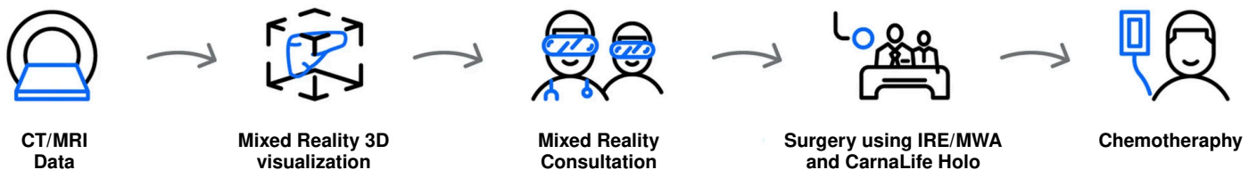
A diagram showing how CarnaLife Holo technology is used in the treatment process.