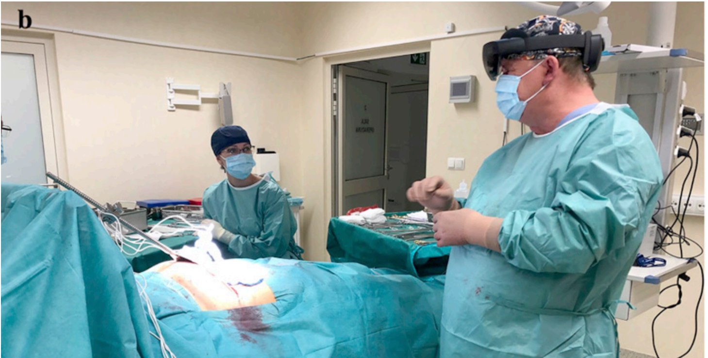
Image 2. Operator wearing Microsoft Holo Lens 2 goggles during the procedure.