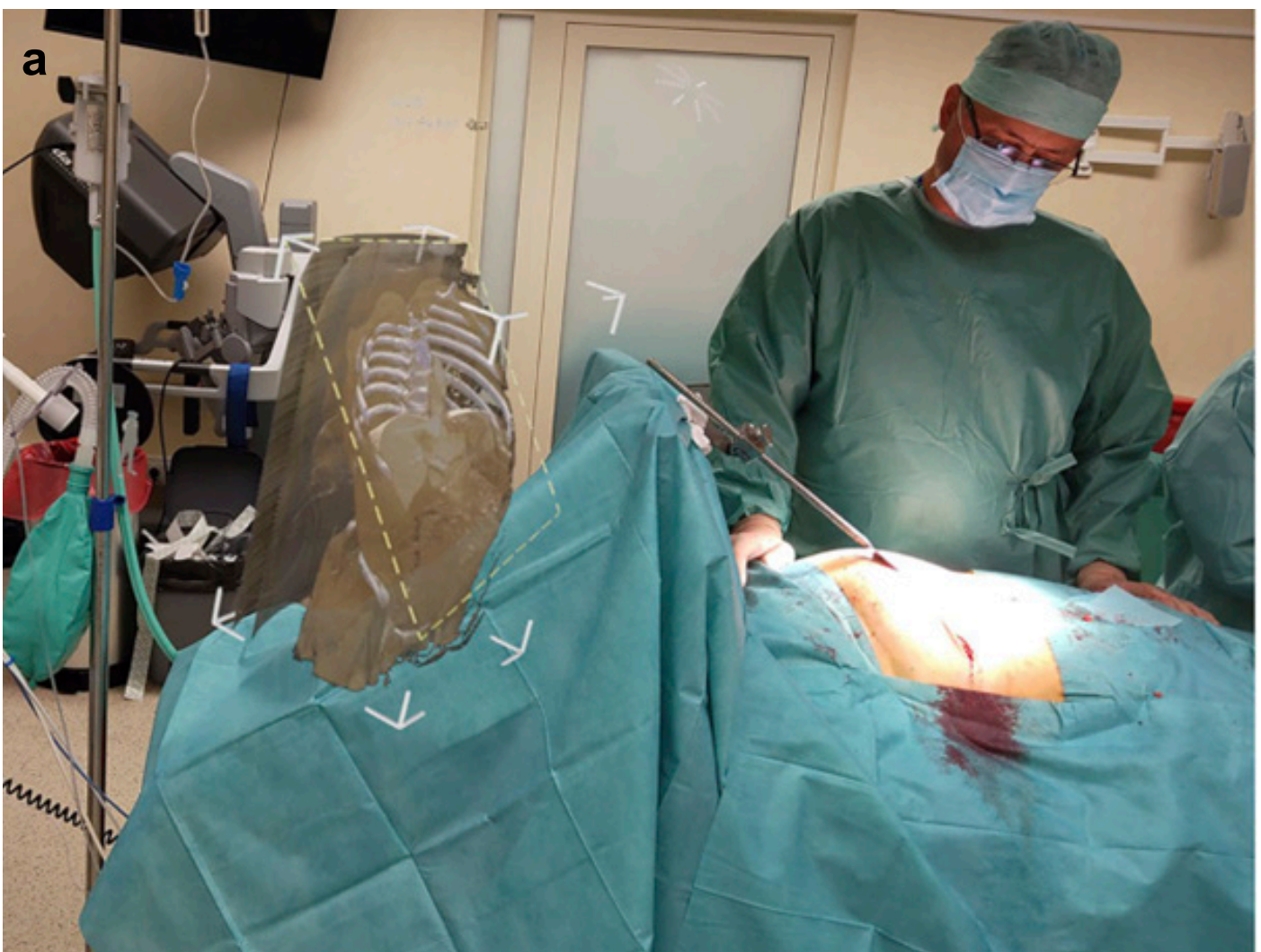
Image 1. Previewing the hologram during a surgery.

cancerous lesion and its topography. It also gives a realistic and complete insight into the nature of the pathology. Looking at a flat two-dimensional image may not be enough to make the right decision whether a case is fit for surgical treatment. With the precision of three-dimensional imaging, surgical oncologists are able to select an optimal extent of the procedure and determine if it is beneficial for the patient.